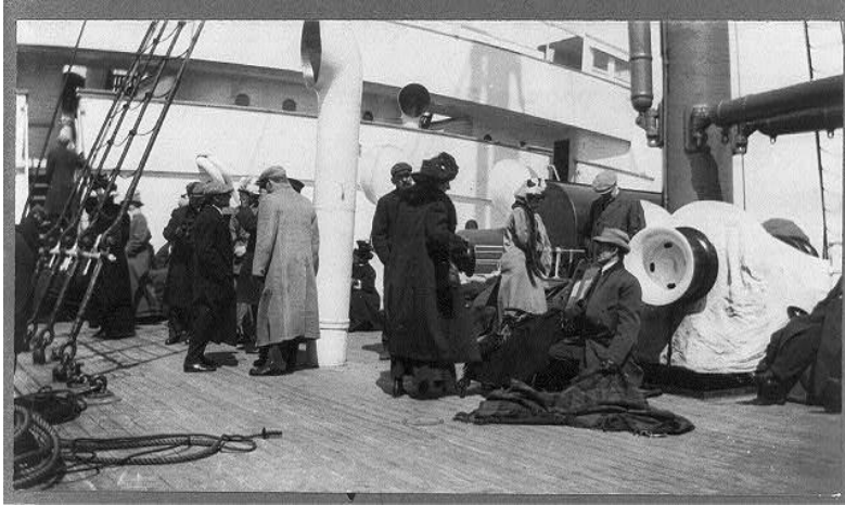
Image Title: Groups of TITANIC survivors aboard rescue ship CARPATHIA: unidentified group on deck