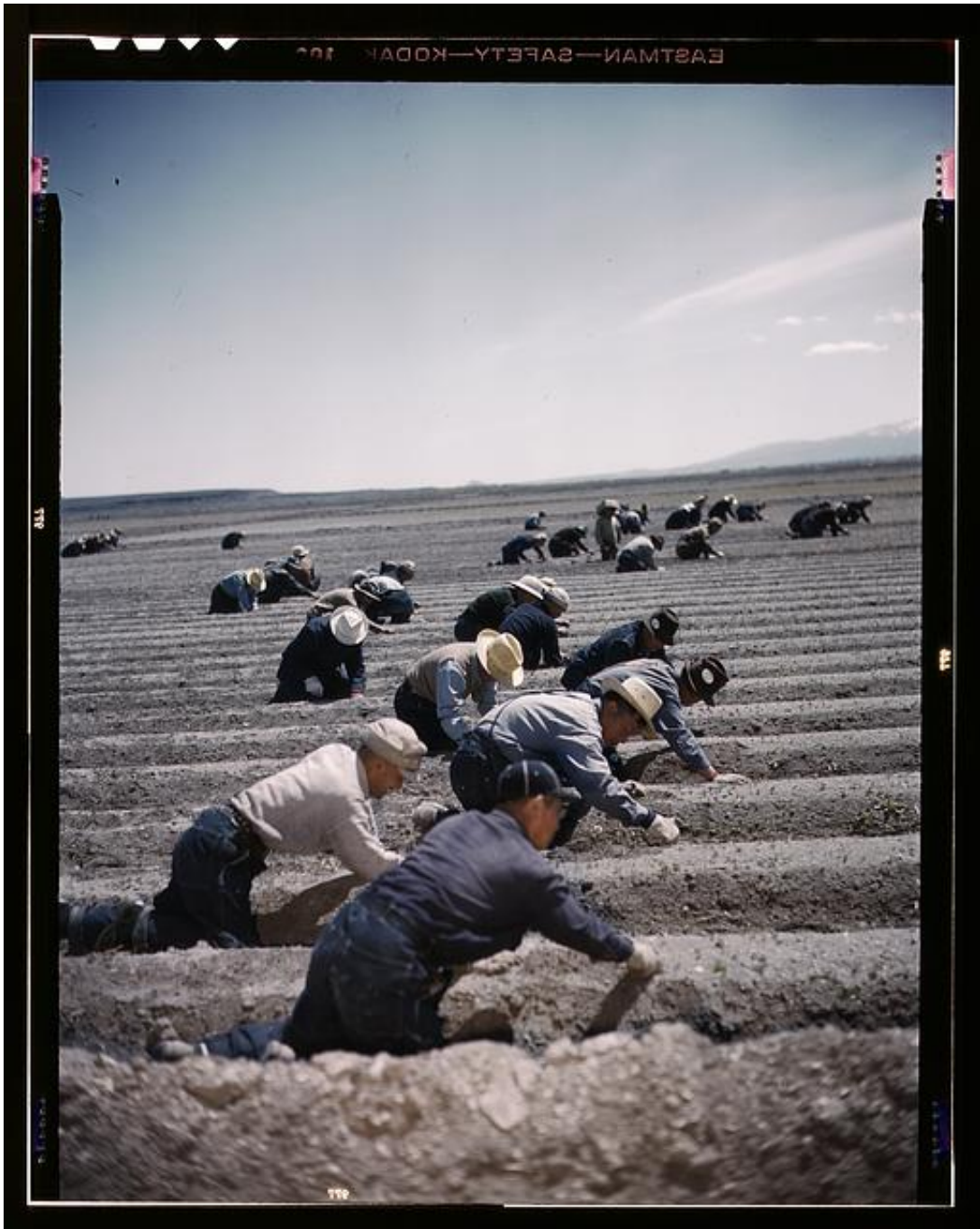
Title: Japanese-American camp, war emergency evacuation, [Tule Lake Relocation Center, Newell, Calif.] Date Created/Published: 1942 or 1943.