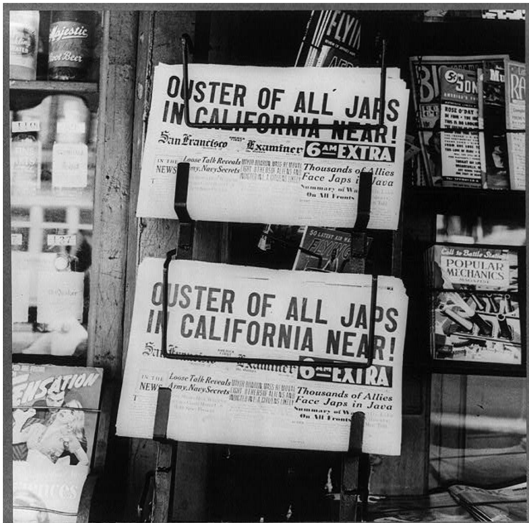
Title: Oakland, Calif., Feb. 1942 Date Created/Published: 1942 February.

http://www. /teachers/classroommaterials/pri..