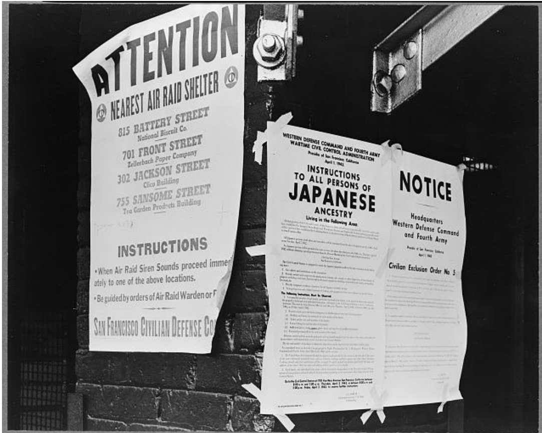
Title: Civilian exclusion order #5, posted at First and Front streets, directing removal by April 7 of persons of Japanese ancestry, from the first San Francisco section to be affected by evacuation Date Created/Published: 1942 April. loc.gov http://loc.gov/pictures/resource/cph.3a35053/