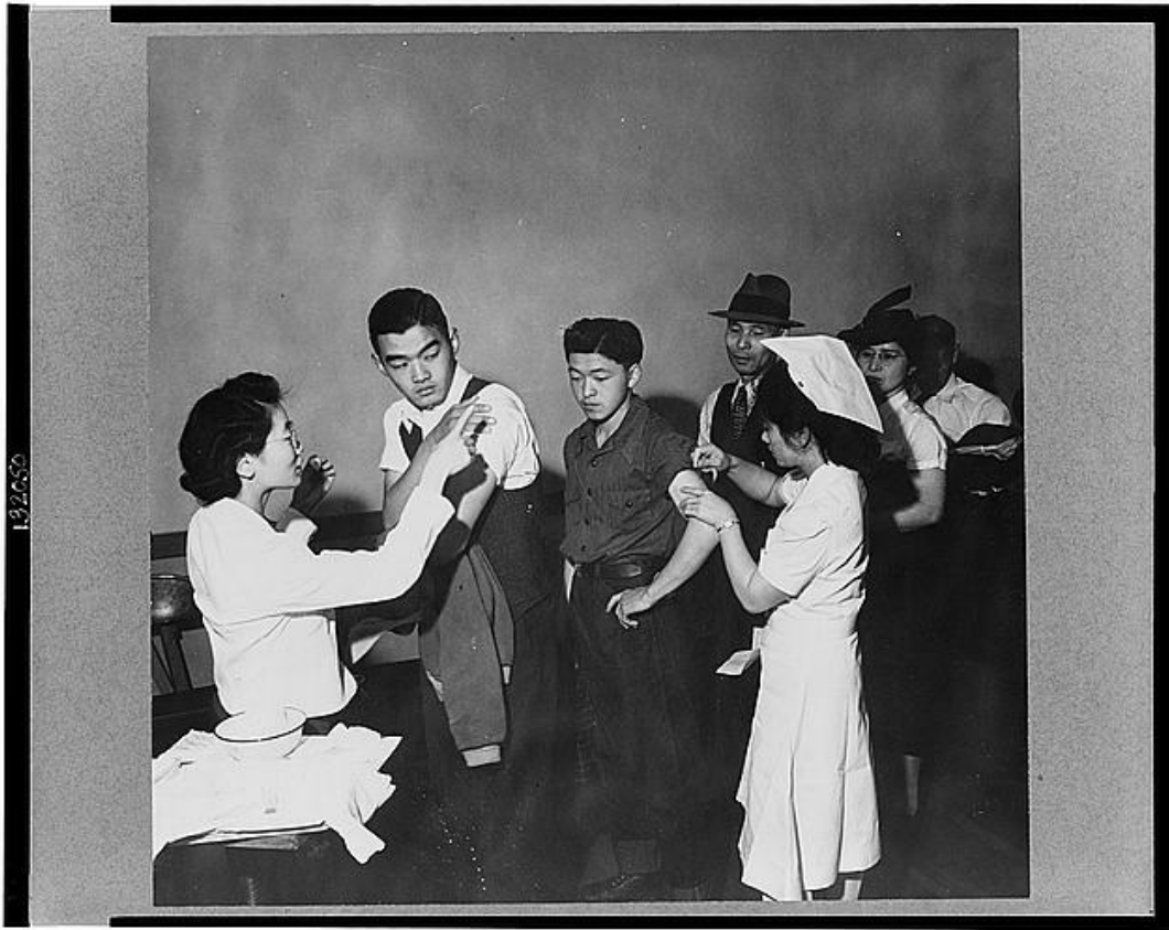
Title: San Francisco, Calif., Apr. 1942 - evacuees of Japanese descent being inoculated as they registered for evacuation, and assignment, later, to war relocation authority centers for the duration of the war Creator(s): Lange, Dorothea, photographer loc.gov http://www.loc.gov/teachers/classroommaterials/pri..